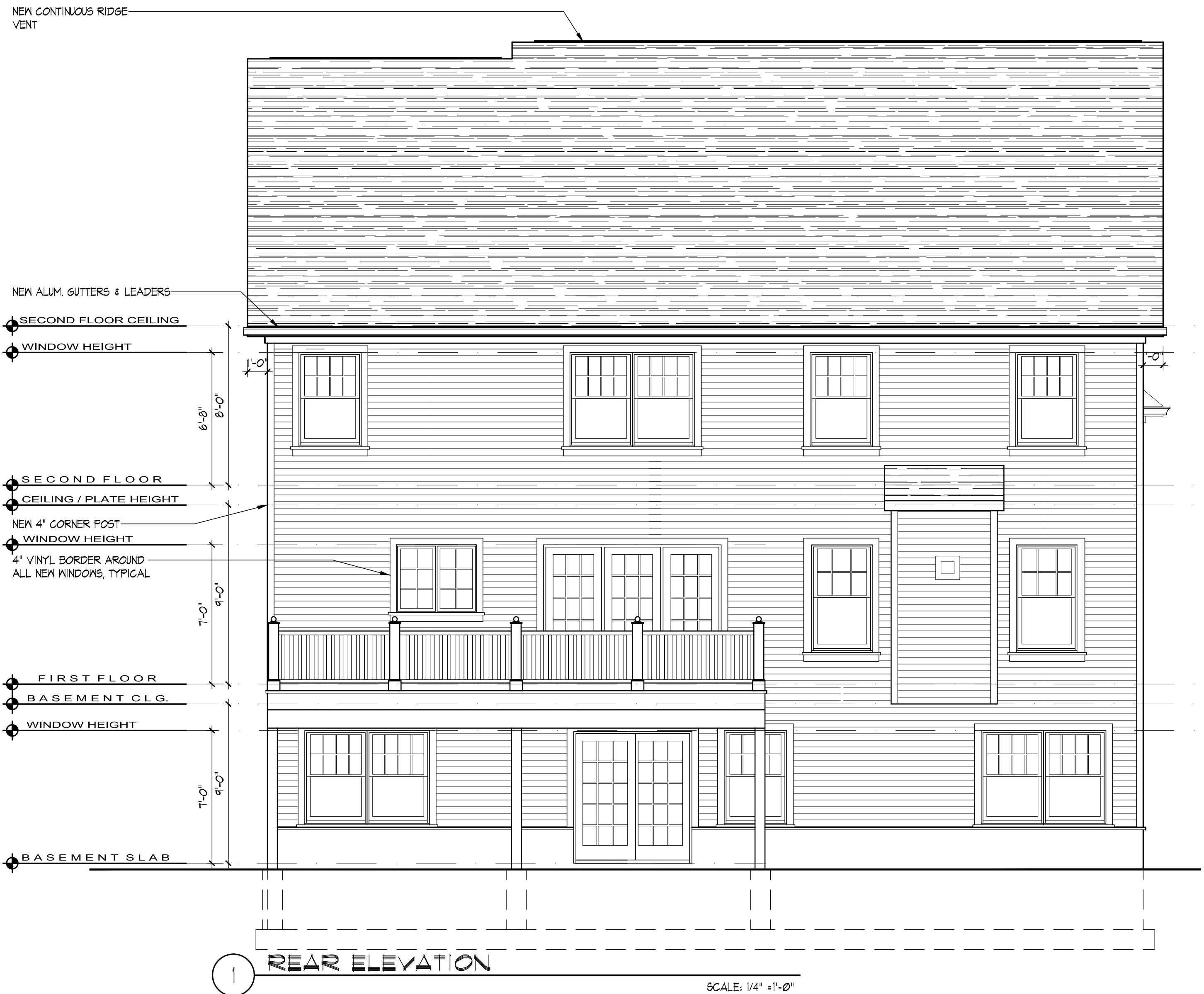
1 REAR ELEVATION