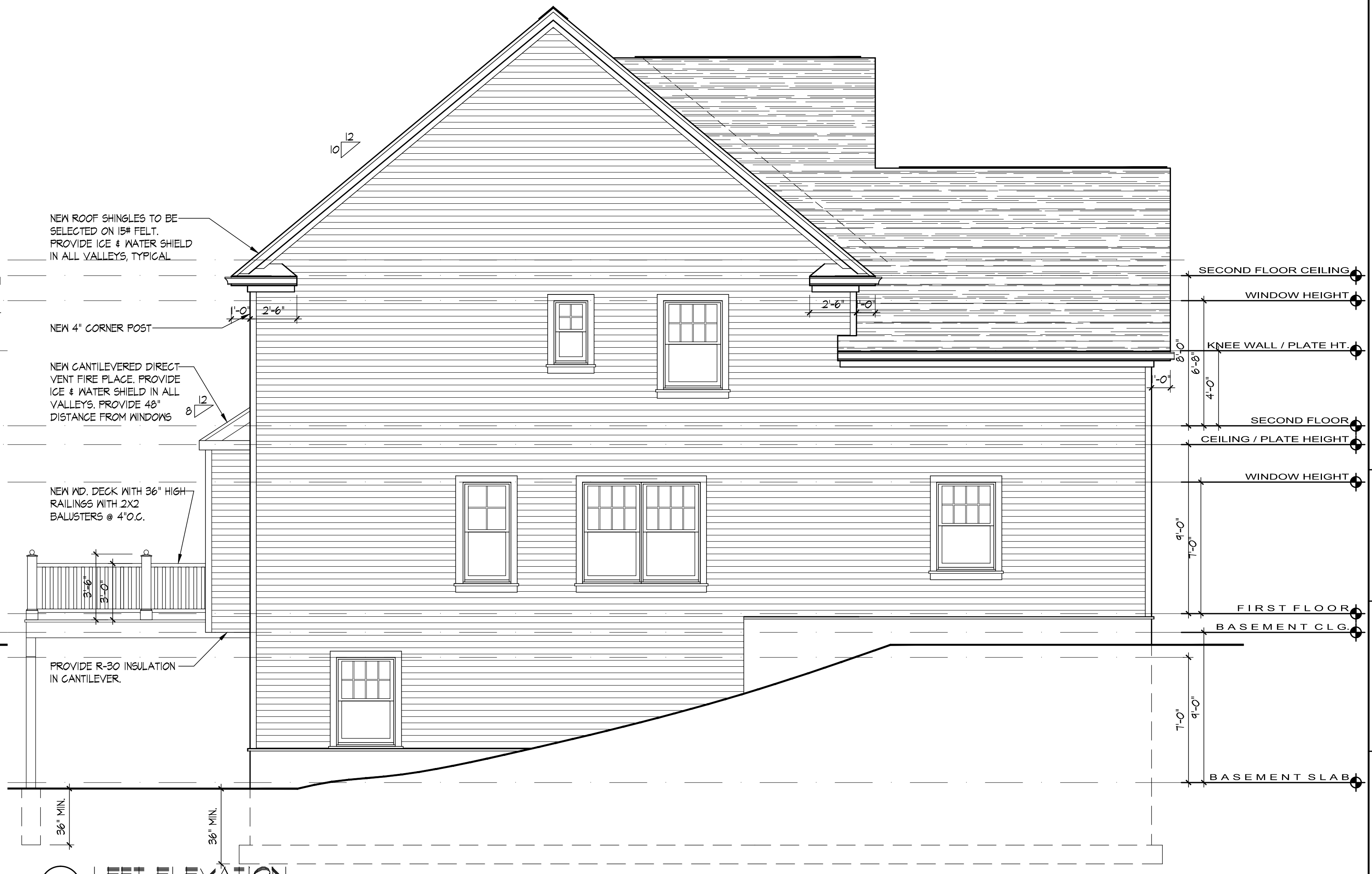
2 LEFT ELEVATION SCALE: 1/4" = 1'-0"